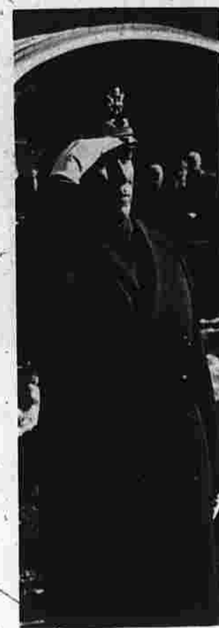
Adjutant General E. Donald Walsh