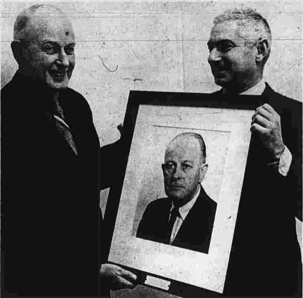
Former Mayor Honored