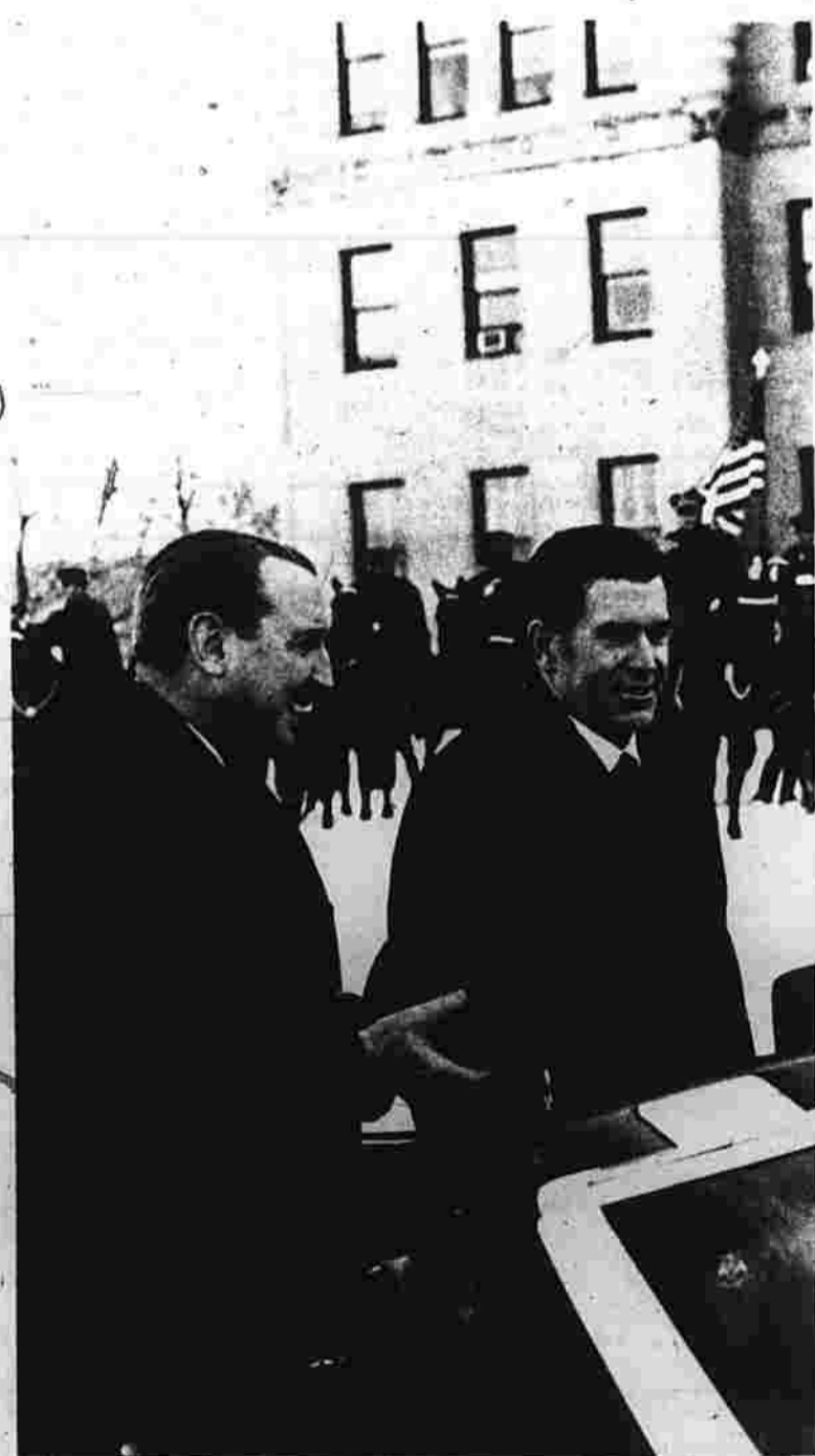
Outgoing Gov. John Dempsey and incoming Gov. Thomas Meskill arrive at State Capitol.