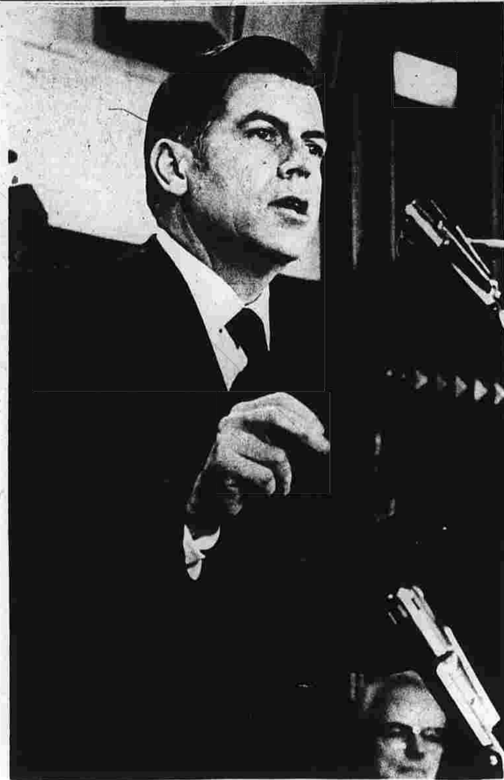
Gov. Thomas Meskill calls for new tax revenues totaling $800 million.